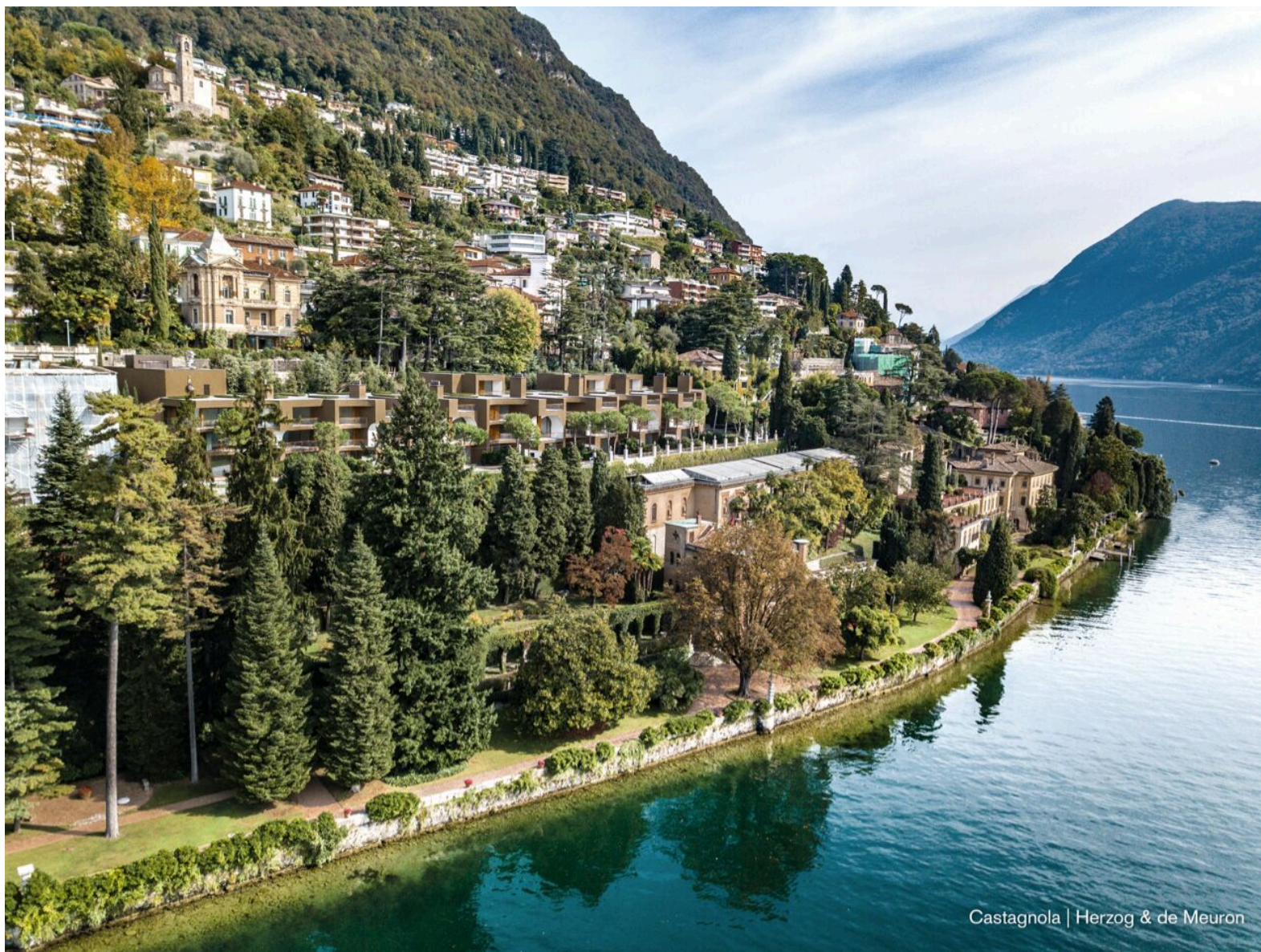
Castagnola | Herzog & de Meuron