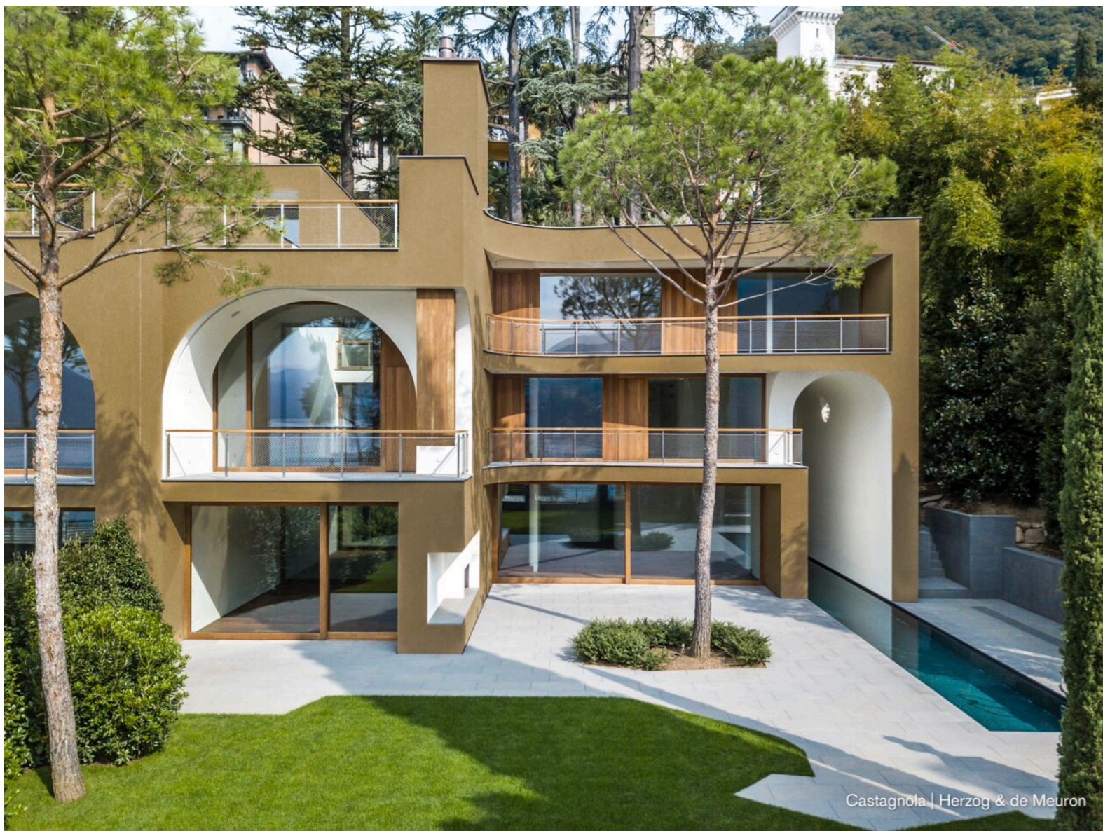
Castagnola | Herzog & de Meuron