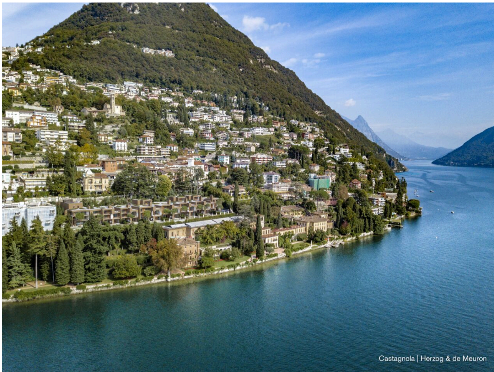
Castagnola | Herzog & de Meuron