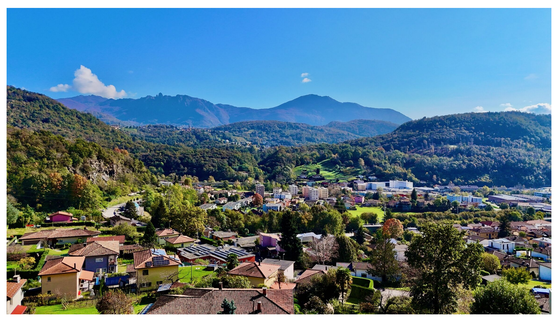
a city is a small village nestled in the hills and mountains